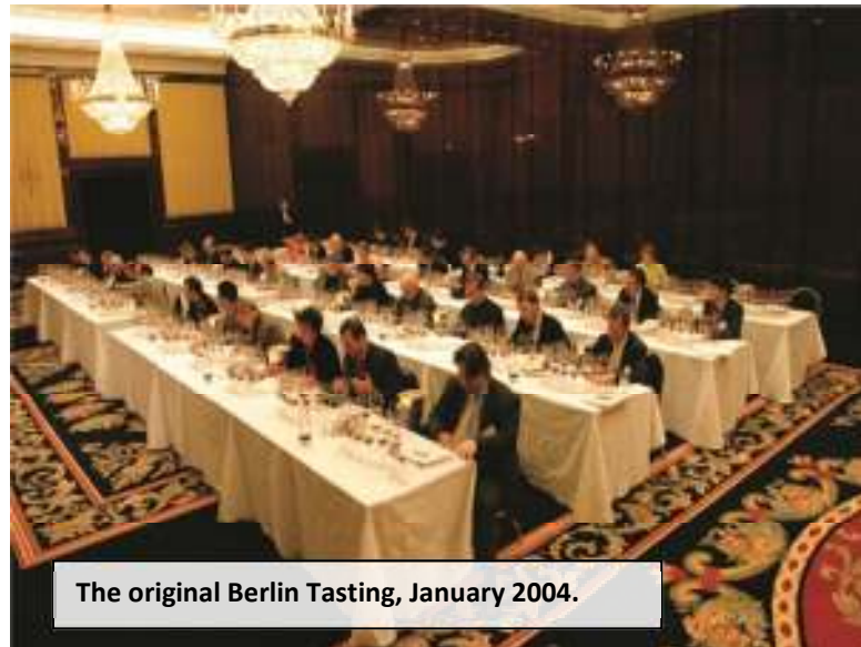
The original Berlin Tasting, January 2004.

On the 23 rd of January 2004, Europe's most highly regarded wine journalists, writers, and buyers were invited to gather in Berlin for a blind tasting of 16 wines from the 2000 and 2001 vintages. The tasting included some of the best wines in the world, most of them rated 100 points by wine critic Robert Parker. The outcome placed Chile's 2000 Viñedo Chadwick and 2001 Seña ahead of legendary world-class wines, thereby establishing the event as a milestone in the history of Chilean wine and a breakthrough for the recognition of Chilean terroirs worldwide.